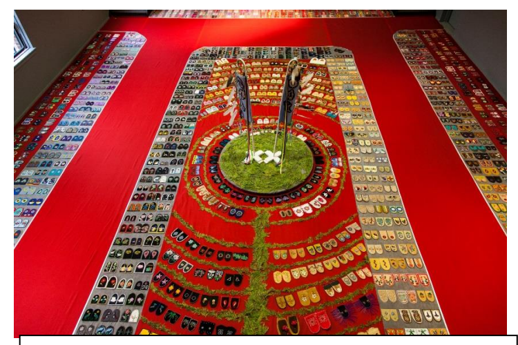
Walking with Our Sisters: A Commemorative Art Installation to honour the lives of missing and murdered Indigenous Women

Each pair of moccasin tops are intentionally not sewn into moccasins to represent the unfinished lives of the women and girls.